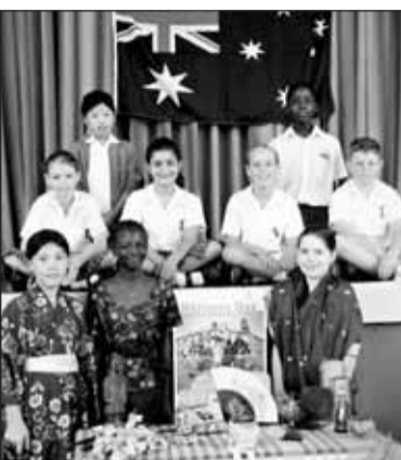
HARMONY LINKS THE WORLD: Children from St Columban's celebrate their acceptance of others.