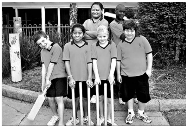
READY TO GO: Year 4 students are eager to begin the game of cricket.

Newcastle is a community and our community pulls together in time of disaster and threat. This time, the threat is to all of us and our families. We have to stand together as one community and say no to drugs and alcohol. We have to tell the Government that we definitely need more police and that our safety is the most important thing. It is our responsibility to take control.