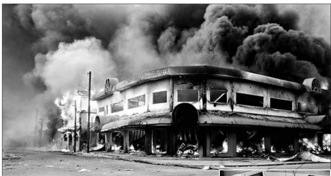
THE SCENE: Main picture, riot-torn Nuku'alofa. Inset: A hearing-impaired student using the computer sent to Tonga by Hunter schools.