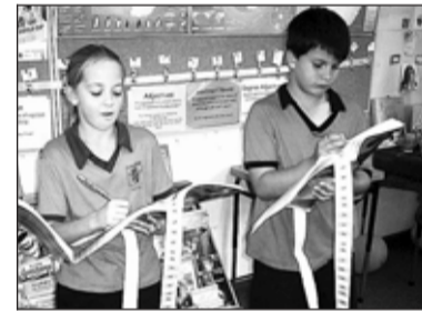
NUMBER WONDER: Learning is fun with ICE-EM.

mathematics departments, the CSIRO and the Department of Mathematical and Information Science has helped develop the new program.