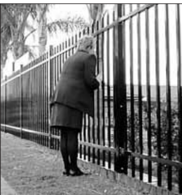
SAFE: The new fence keeps vandals out and members of the school community in.