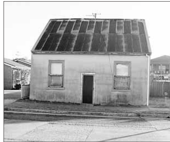
MEMORIES: One of the last mining cottages in Lambton.