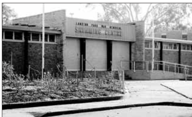
CENTRE OF FUN: Is this familiar site about to change?

If anybody sees anyone suspicious around St John's PS, Lambton, please notify the police.