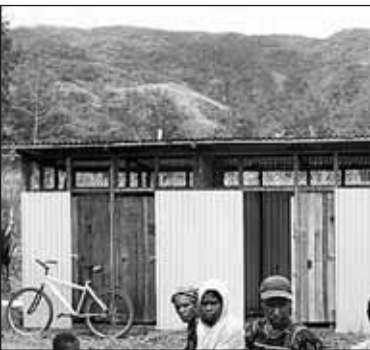
NEW FACILITIES: These toilets were built using money raised by students at St Therese's PS.