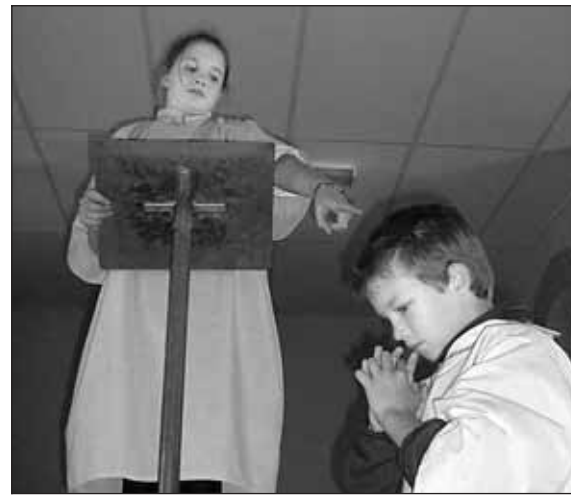
ROLE-PLAY: Demonstrating early democracy.

Opinions expressed in this newspaper are not necessarily those of the competition sponsors.