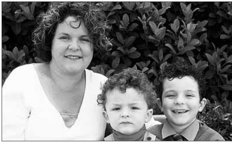
HAPPY AT LAST: The Nolan family is happy to be safe and sound at home.

The Times strongly believes that music is a great way to get a message out to a targeted audience. Not only are live concerts entertaining, they are also a great way to express an opinion and maybe educate at the same time.