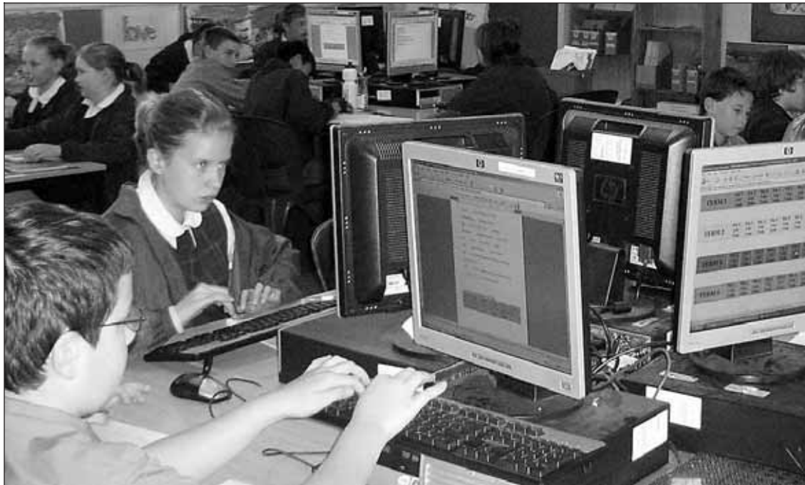
LITRES OF FUN: Children enjoying the new technology.