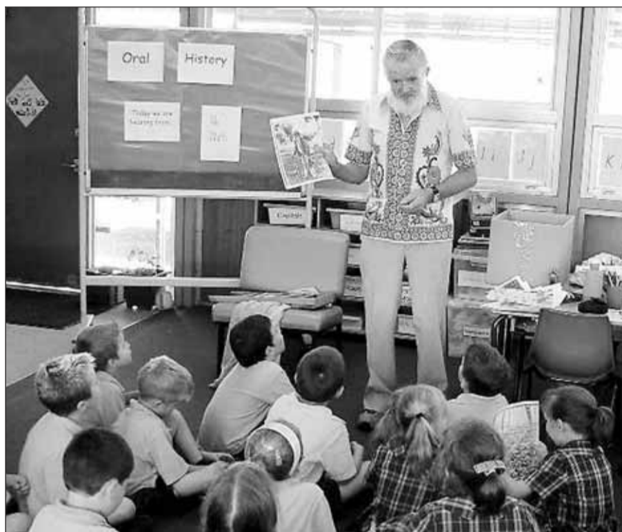
GETTING INVOLVED: One of Glendore PS's father figures gives a local history lesson.