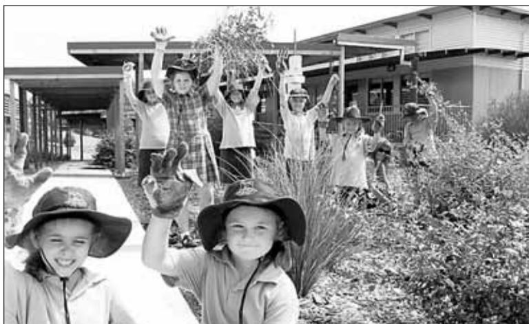
PEOPLE POWER: Students creating a delightful school environment.

Fathers need to realise how important they are to the well being of their sons. They need to be open to ideas that will help them to be better prepared to be the role model their sons need as they prepare for a successful life in society.