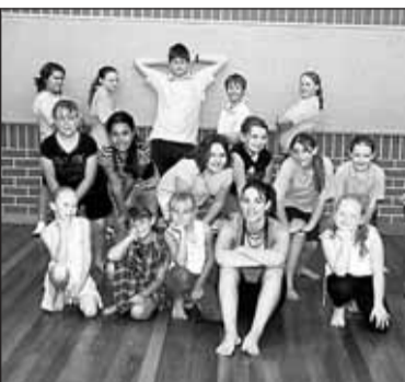
MOVE IT: Students about to begin their hip-hop activities.