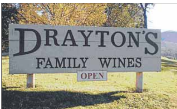
STILL GOING: Drayton's quickly re-opened despite another terrible family tragedy.