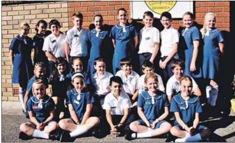
STRONG SIDE: St Patrick's Primary School Leadership Team 2008.

Raising awareness is viewed by St Patrick's as the key to preserving our environment. We can all make a difference in one way or another. Our vision is to be the best eco-friendly school that we can possibly be, and to be proud of it.