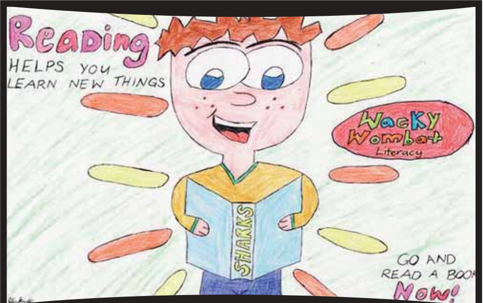
Advertisement created by the students of St Joseph's PS, Merewether.