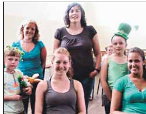
AUSSIE CULTURE: Norwegian students enjoy St Patrick's Day at St Columban's.

They found the vineyards and Hunter Valley irresistible. It seems that the students will take a very positive experience of Australia home to Norway.