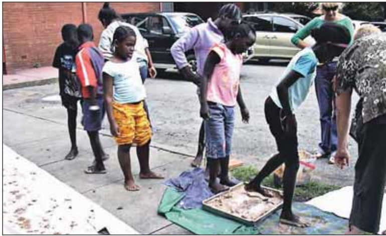
FEET AND ALL: Children make footprints for the shoe project.