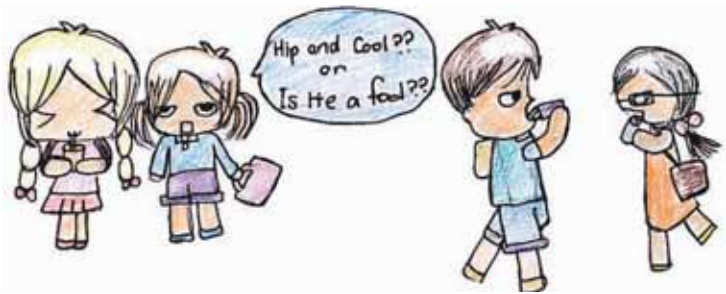
NO MORE: Binge drinking is no longer cool. — Illustration by Soo An

It is a national disgrace to have Newcastle shown in this ugly light.