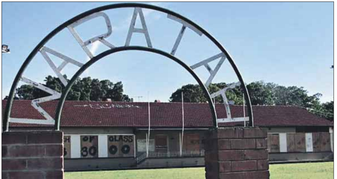
HISTORY TO CHANGE: Waratah Bowling Club will take on a new look with murals showing Newcastle's history to replace the boxed-in windows.

the environment and provide a quiet area for aged people who are suffering dementia. It will give them a place to wander and calm down.