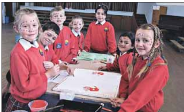
CULTURAL SHARING: Children at St Columban's Mayfield share their cultures.

The ECC will share the building with Life Without Barriers.