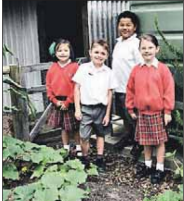
LIFE'S A CYCLE: Children prepare their entry for the Newcastle Show.