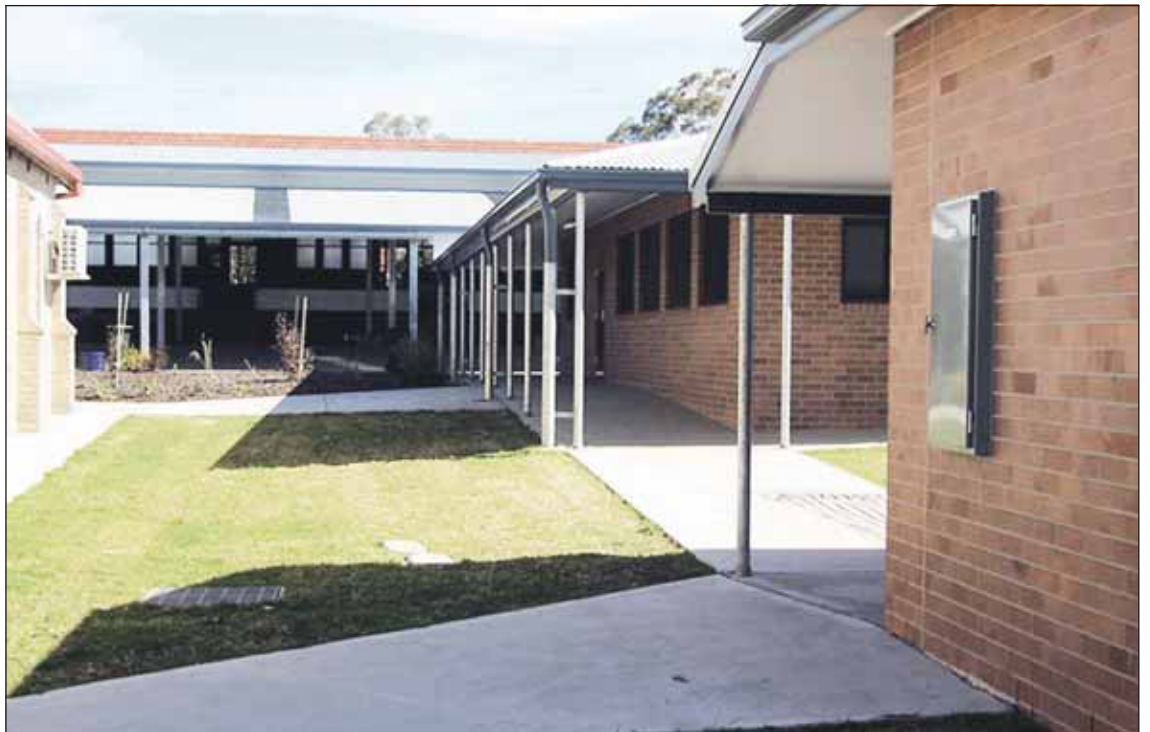
MODERN: Part of the new buildings at Our Lady of Lourdes Primary School at Tarro.

Parents said they felt the school had improved enormously and they also think that it's a delight to have their children come to the school