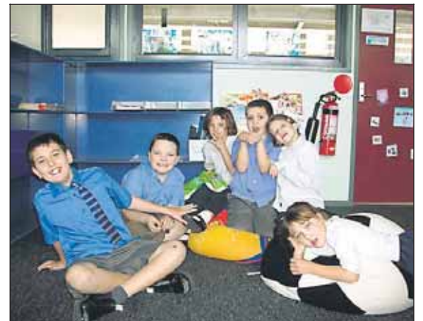
HAPPY DAYS: The Years 3 to 6 Rainbow class.

Opinions expressed in this newspaper are not necessarily those of the competition sponsors.