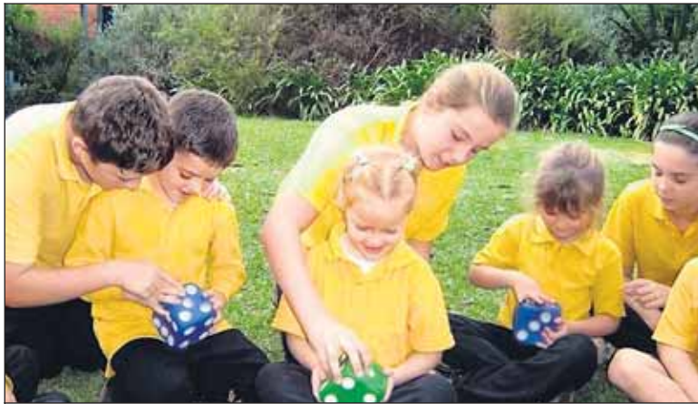
QUEST: Senior students help younger students with their playground activities.