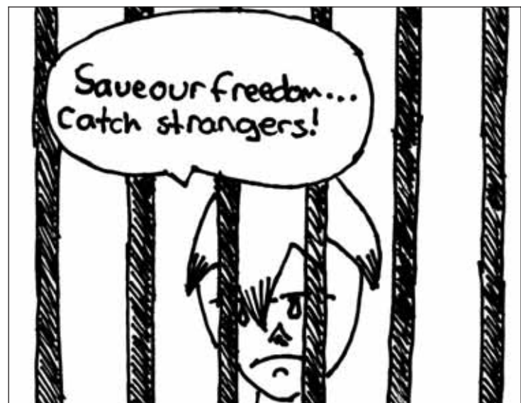
— Illustration by Tyler Cox

Opinions expressed in this newspaper are not necessarily those of the competition sponsors.