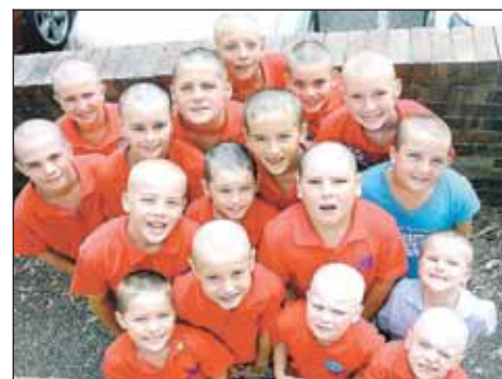
FOR A GOOD CAUSE: Some of the Jewells students who went in the World's Greatest Shave.